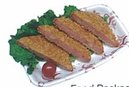
Food Packaging (PSP)