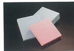
Insulation Board (XPS)