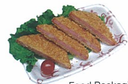
Food Packaging (PSP)